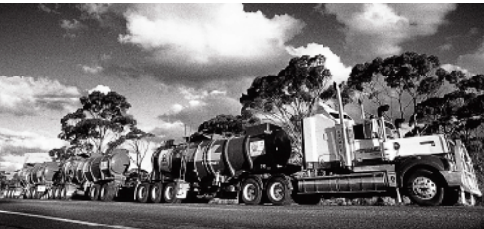
The Orica Toll Energy road train, which supplies the mines in Western Australia's Kalgoorlie region, is just part of Toll's mining and resources distribution expertise.

Our satisfactory financial performance will only improve as our logistics abilities are recognised and the restructuring benefits continue to flow.