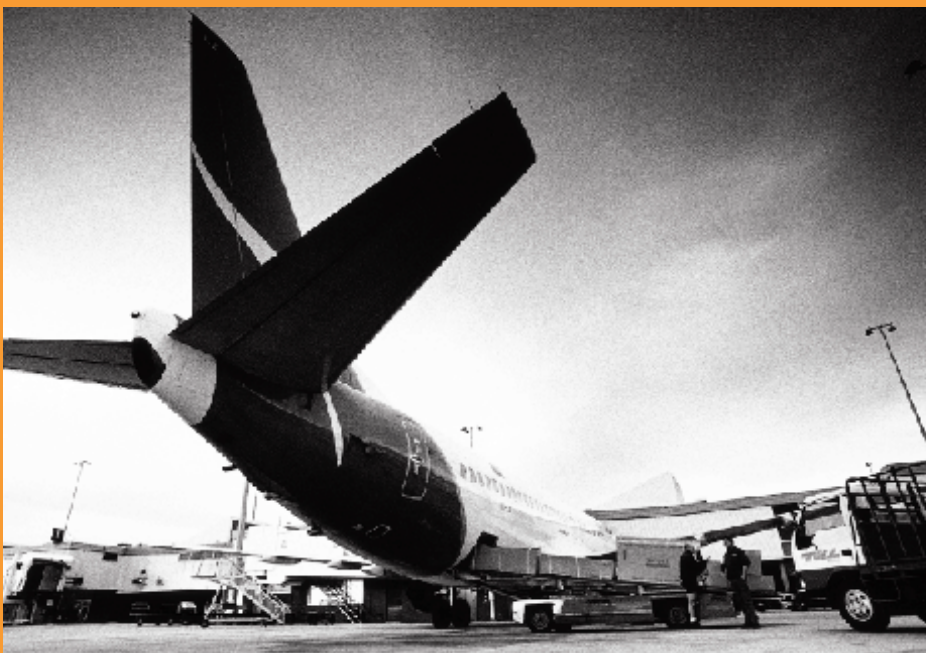
We like challenges such as the delivery of time-critical freight for Toyota interstate overnight. We regularly pick up freight at 4.00 pm in Melbourne and deliver it to Toyota's rural dealer network throughout South Australia by 8.30 am the next day.