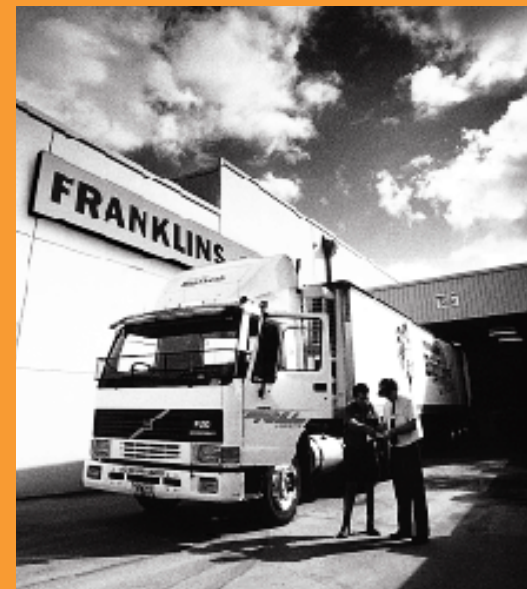
Toll provides Franklins with warehouse and intrastate delivery throughout New South Wales.