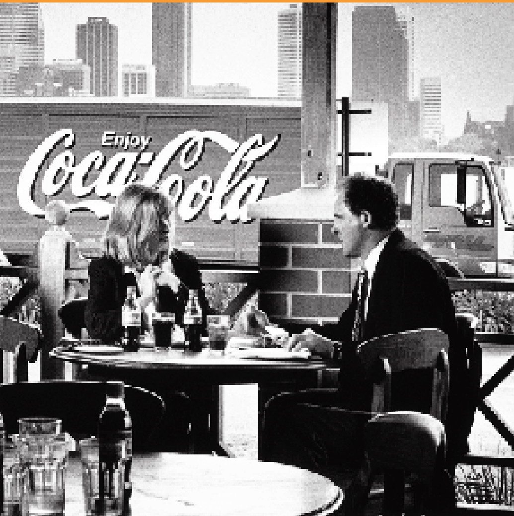
Toll, now a real alternative for Coca-Cola Amatil, delivers to Perth's Plantation Estate restaurant.